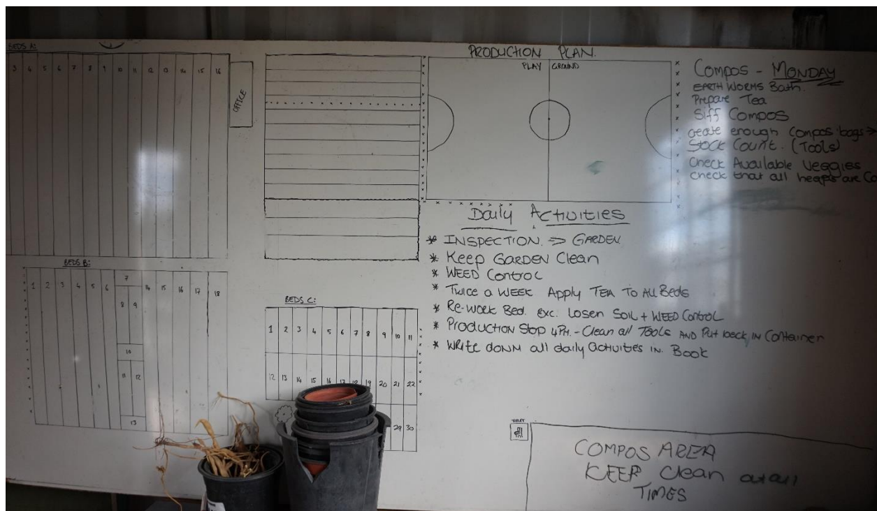
Figure 8: Production and Plot Plan at Beacon Organic Garden.

RECORD KEEPING supports the documentation of the farming activities and the income generated with urban agriculture. The farmer can compare data of previous years and note challenges and solutions to have a self-led and ongoing learning process. A farming diary can be a simple notebook, where the farmer writes down what was planted (quantity, how and why), what was used as inputs (fertiliser, pest management, how and why), and what was harvested and sold (quantities and prices). A simple cost calculation of inputs and outputs can show whether the production is profitable. It is recommended to also take notes on challenges, on solutions and on own consumption of the produce. This gives the farmer a clear picture on the impact of the farming activities.