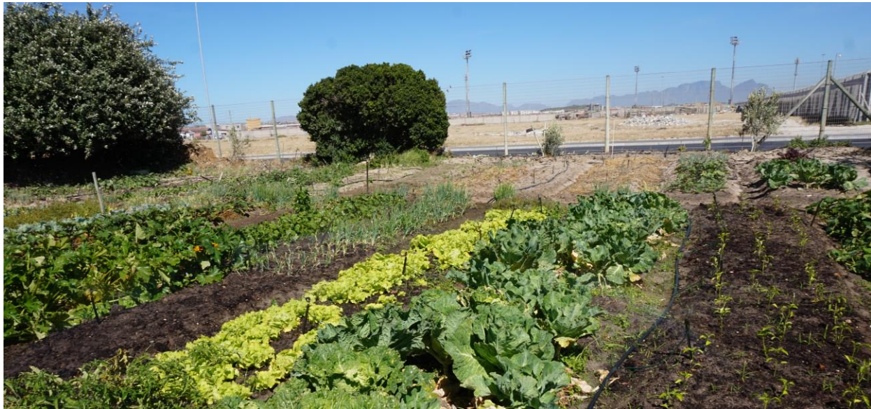
Figure 7: Applying methods to avoid pests and diseases in Khayelitsha, Scagar Garden.

The main ways of ensuring a healthy crop production are as follows: