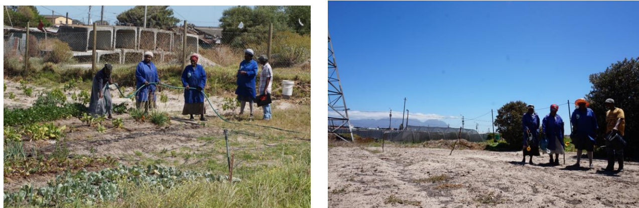
Figure 5: Fezeka Garden in Gugulethu in 2016 and 2018.

Although CSA differs from other agricultural development concepts by explicitly addressing climate change, it uses techniques and practices covered by other agricultural systems (i.e. Sustainable Land Management, Organic Agriculture etc.) - also on water wise production, as presented in the table on the next page: