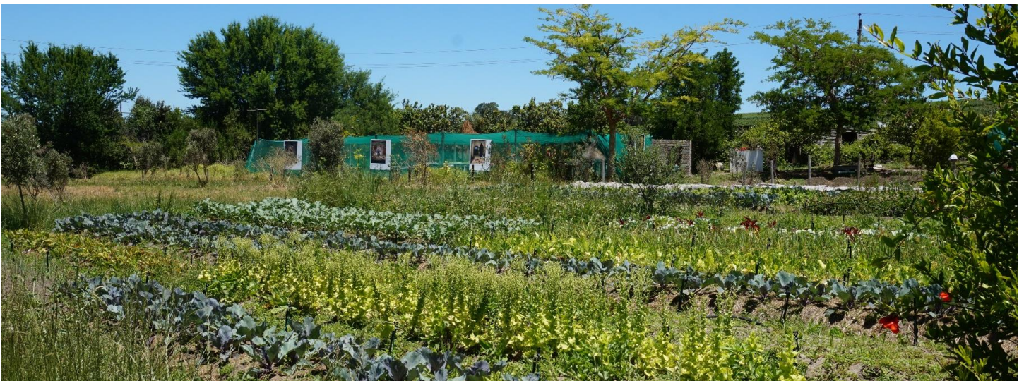
Figure 4: Organic Food Garden in Stellenbosch.

URBANGAPs are not equivalent to organic certification schemes but can be a base to set up further quality standards. As a participatory developed tool, it can be used as monitoring and evaluation guideline for PGS certification. A Participatory Guarantee System (PGS) is a bottom up system of quality assurance. Farmers, consumers, retailers meet once a year on each other's farm to assess farming practices. A PGS should ideally be championed by the farmer's peer to peer review and consumer interaction. It is built up on trust, community and shared knowledge, has a common vision of local farmers and enables local market access. URBANGAPs will be incorporated into the Western Cape PGS as a subgroup of the urban Capetonian farmers.