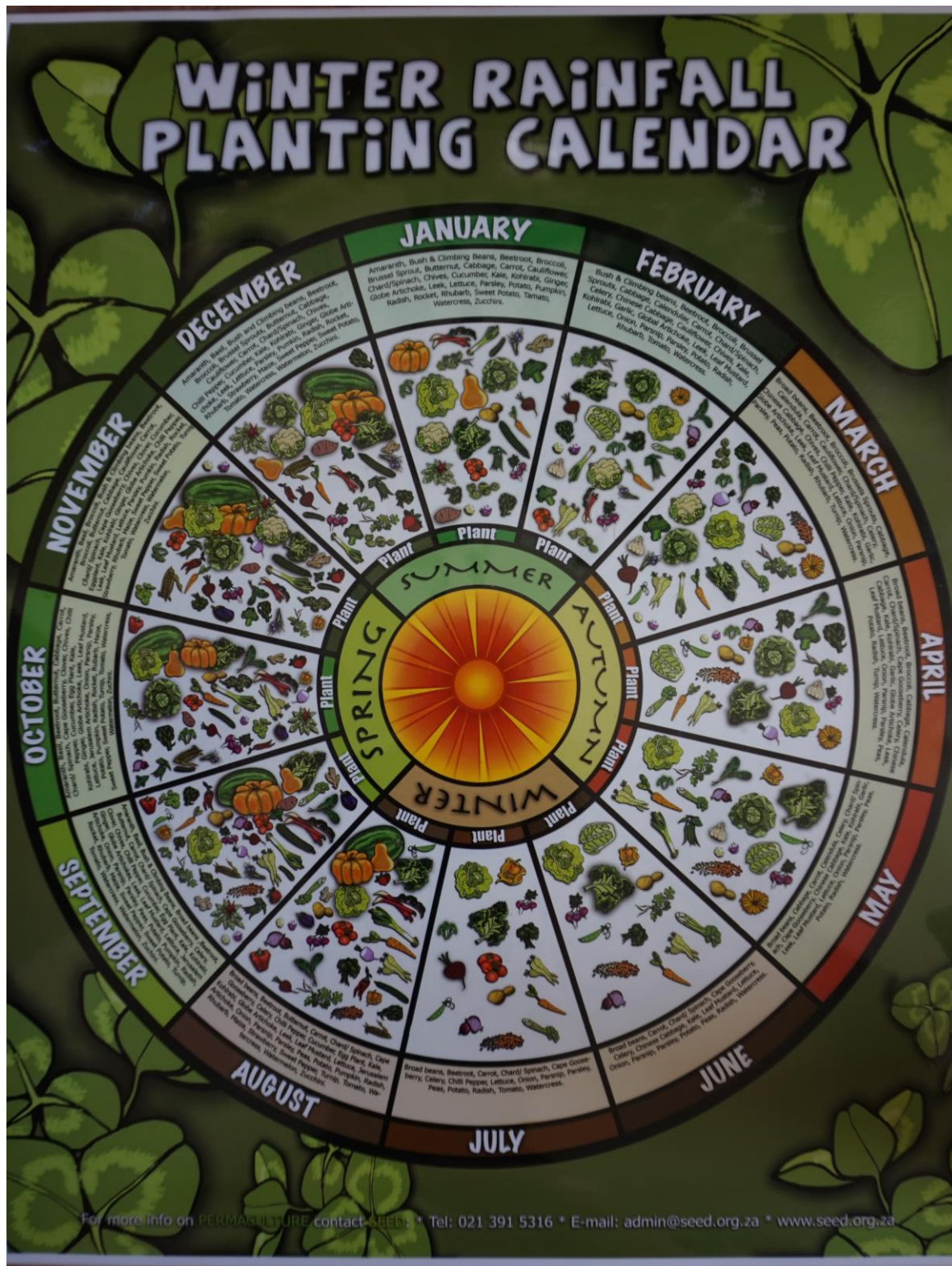
Figure 3: Winter Rainfall Planting.