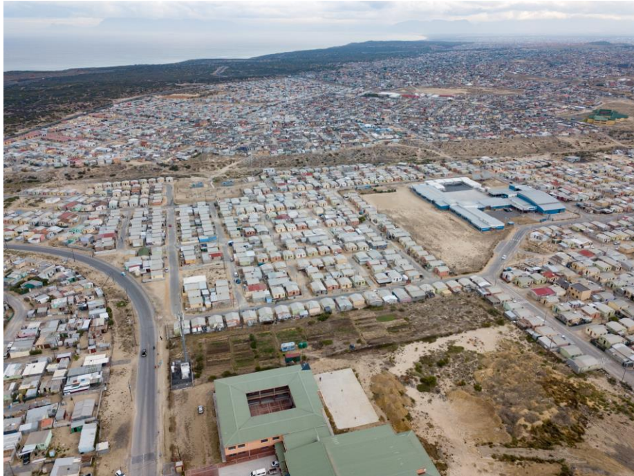
Figure 1: Urban agriculture in Khayelitsha, Cape Town's biggest township.

Since March 2016, the Federal Ministry of Food and Agriculture (BMEL) through the Federal Office for Agriculture and Food (BLE) has supported UFISAMO (Urban Agriculture for Food Security and Income Generation in South Africa and Mozambique) on urban agriculture in Cape Town, South Africa and Maputo, Mozambique. The objectives of the project are to investigate how urban agriculture contributes to improved food and nutrition security of the small-scale urban farmers in informal and marginalised areas of the city - likewise, how to increase income by optimising production, processing and marketing of horticultural and livestock products.