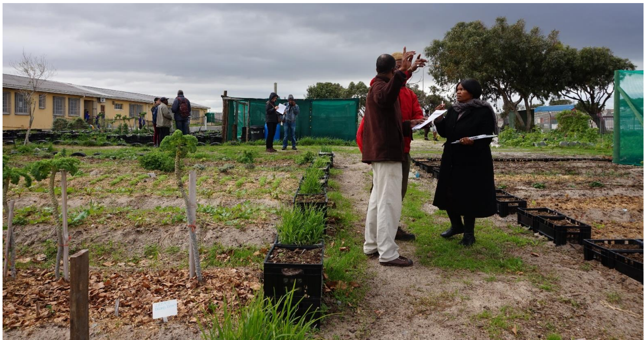
Figure 2: Monitoring urbanGAPs in Mitchells Plain.

Urban agriculture production sites in Cape Town have a size between 100 m 2 to maximum 1 ha. The majority of these urban farmers are small-scale producers. Hence, third-party certification is too expensive and the niche markets which require certification are hardly accessible for small-scale producers. Therefore, the focus of the guidelines is on improved and environmentally-friendly production/cultivation practices of the farmers. Issues common to certification schemes, like pesticide application, workers welfare, traceability etc. have thus not been considered for Cape Town. Nonetheless, URBANGAPs are developed to be the base for other certification schemes.